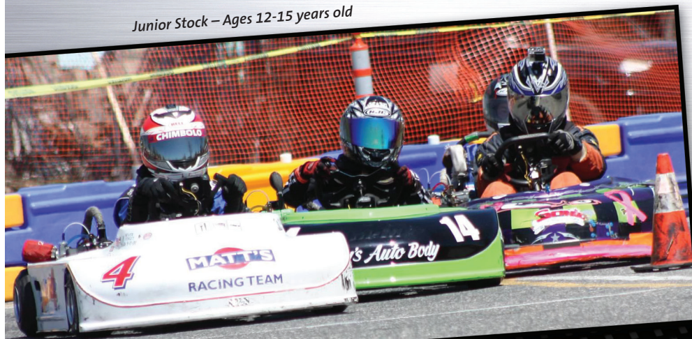
Junior Stock – Ages 12-15 years old